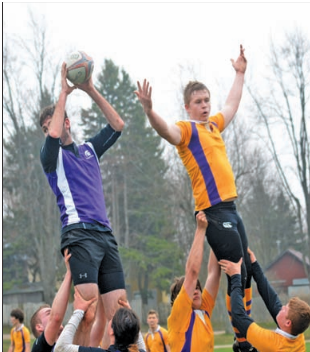
The Centre Dufferin District High School Royals senior rugby team host the Centennial Collegiate V.I. Spartans on the main field at CDDHS on Tuesday, April 25. It was a game held in a light drizzle with the Royals coming out on top with a 12-5 win.