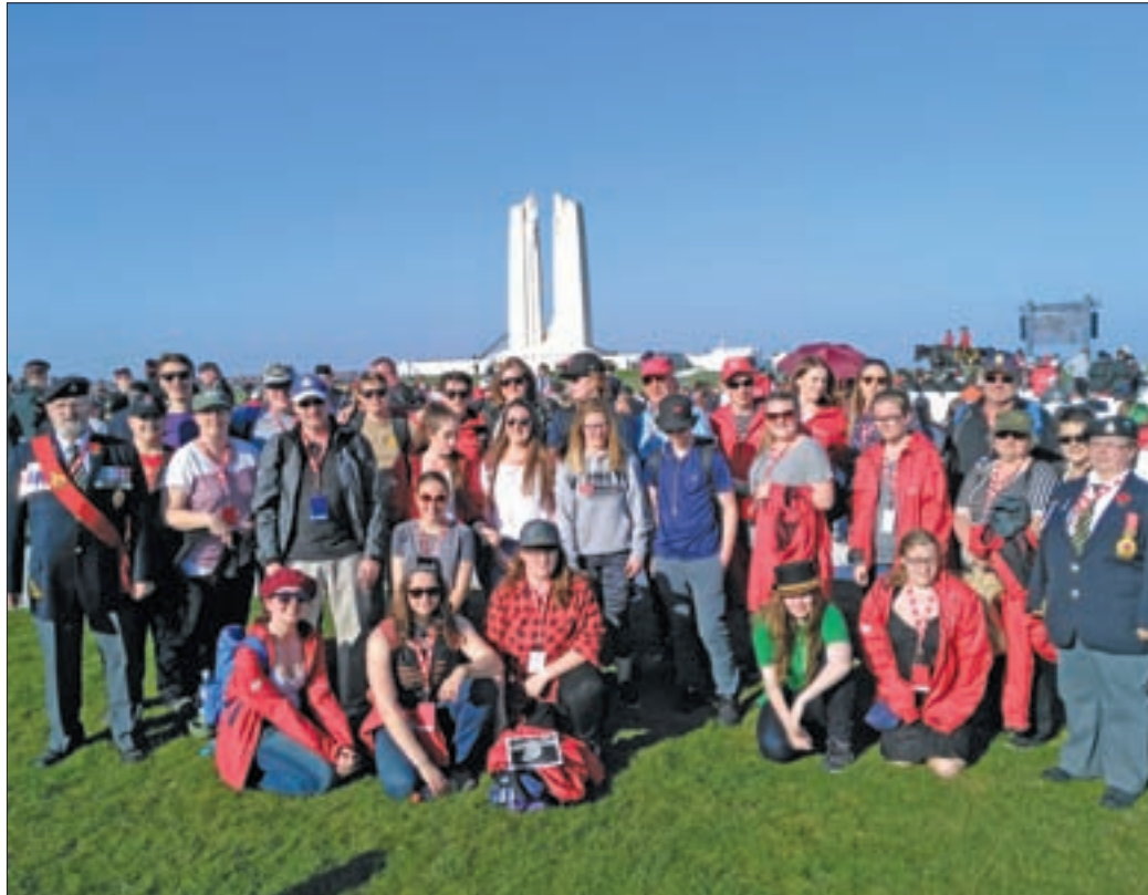
Dufferin students travelled to Vimy Ridge in France earlier this month to commemorate the 100th anniversary of a battle that saw 3,598 Canadian soldiers killed and 7,000 wounded when their four divisions stormed the ridge on April 9, 1917. Facing a barrage of machine gun fire against horrible odds, the strategy and valour of the Canadian soldiers captured the ridge and established Canada as a young nation to be respected on the international stage. Centre Dufferin students are seen here at the Vimy Ridge Ceremony April 9.

It is incumbent on the Trudeau government to remind President Trump and Congress of this fact at every opportunity.