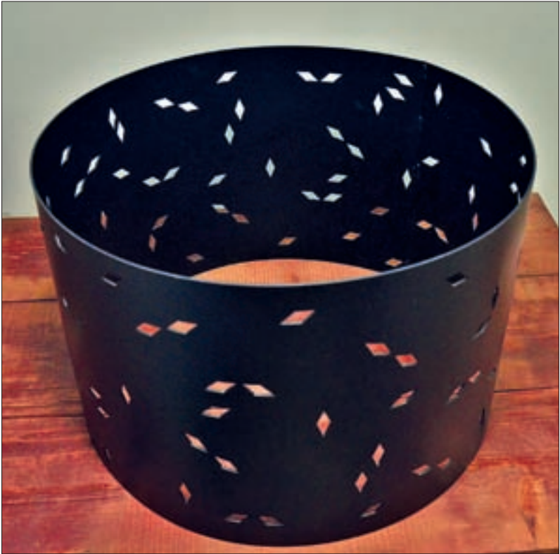
Diamond Cut Fire Ring being raffled off in support of baby Madden.