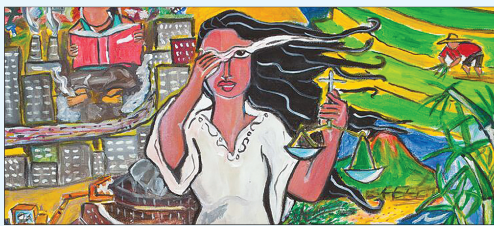
WORLD DAY OF PRAYER – A Glimpse of the Philippine Situation tells the story of “God’s economic justice in contrast to the economy of the strong and the powerful” for World Day of Prayer, led by the women of the Philippines. Shelburne’s service will be held this Friday, March 3. For more, see Page 9.

Thinking of Selling? List with Confidence!