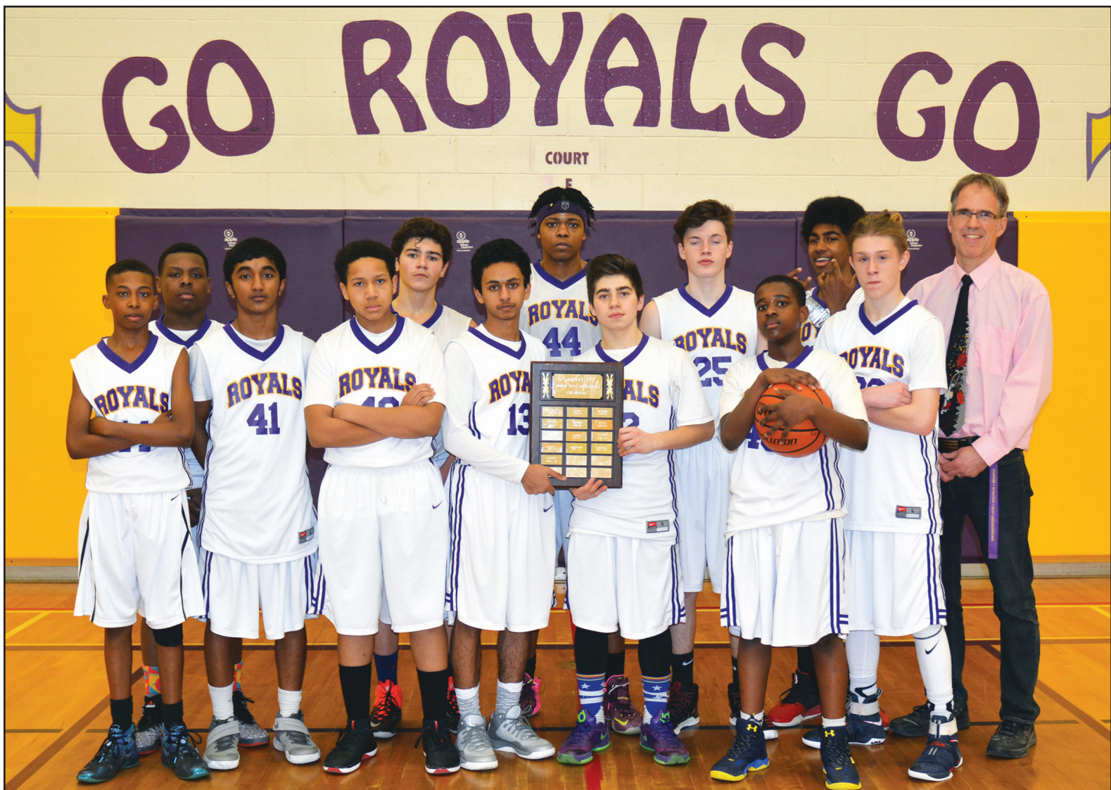
GAME FACE –The Centre Dufferin District High School Royals junior boys basketball team claimed the District 4 championship on Wednesday, February 22, with a 52-40 win over the Wellington Heights Secondary School Wolverines. The final game took place in the gym at CDDHS. The Royals will now go on to compete at the regional level at CWOSSA. Here, teammates decide to forego the traditional smiles in order to strike some fear in the hearts of their opponents. Well done, gentlemen! For more, see Page 8.