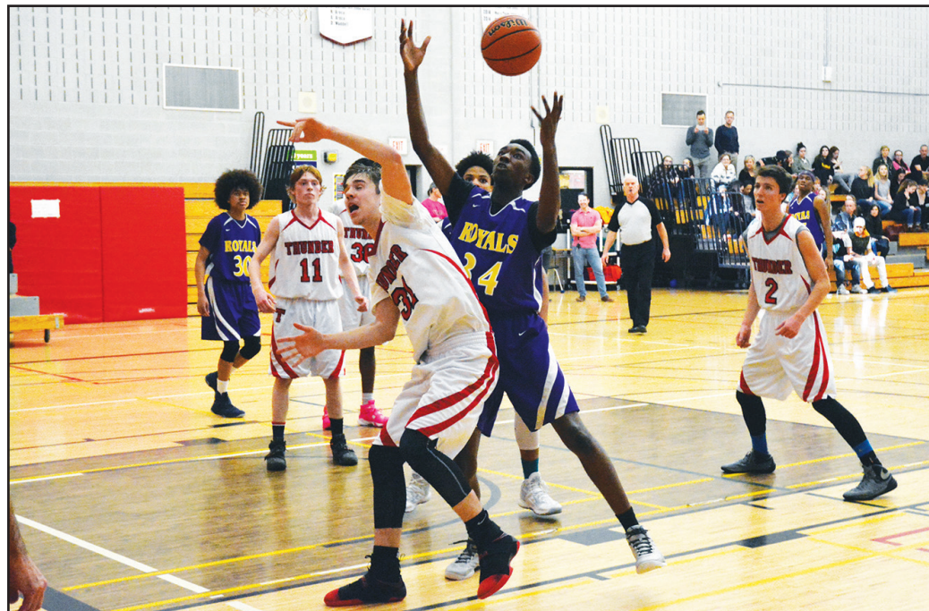
The Centre Dufferin District High School Royals senior basketball team take on the Westside Secondary School Thunder in the Westside gym in Orangeville for the District 4 senior championship on Wednesday, February 22. The Royals had a good lead in the first half but Westside battled back and went ahead in the third quarter. A final free throw late in the fourth quarter gave the Thunder a 60-57 lead to claim the District championship.

Westside was the only team the Royals lost to this season. The Thunder will now continue on to compete at the regional level at CWOSSA.