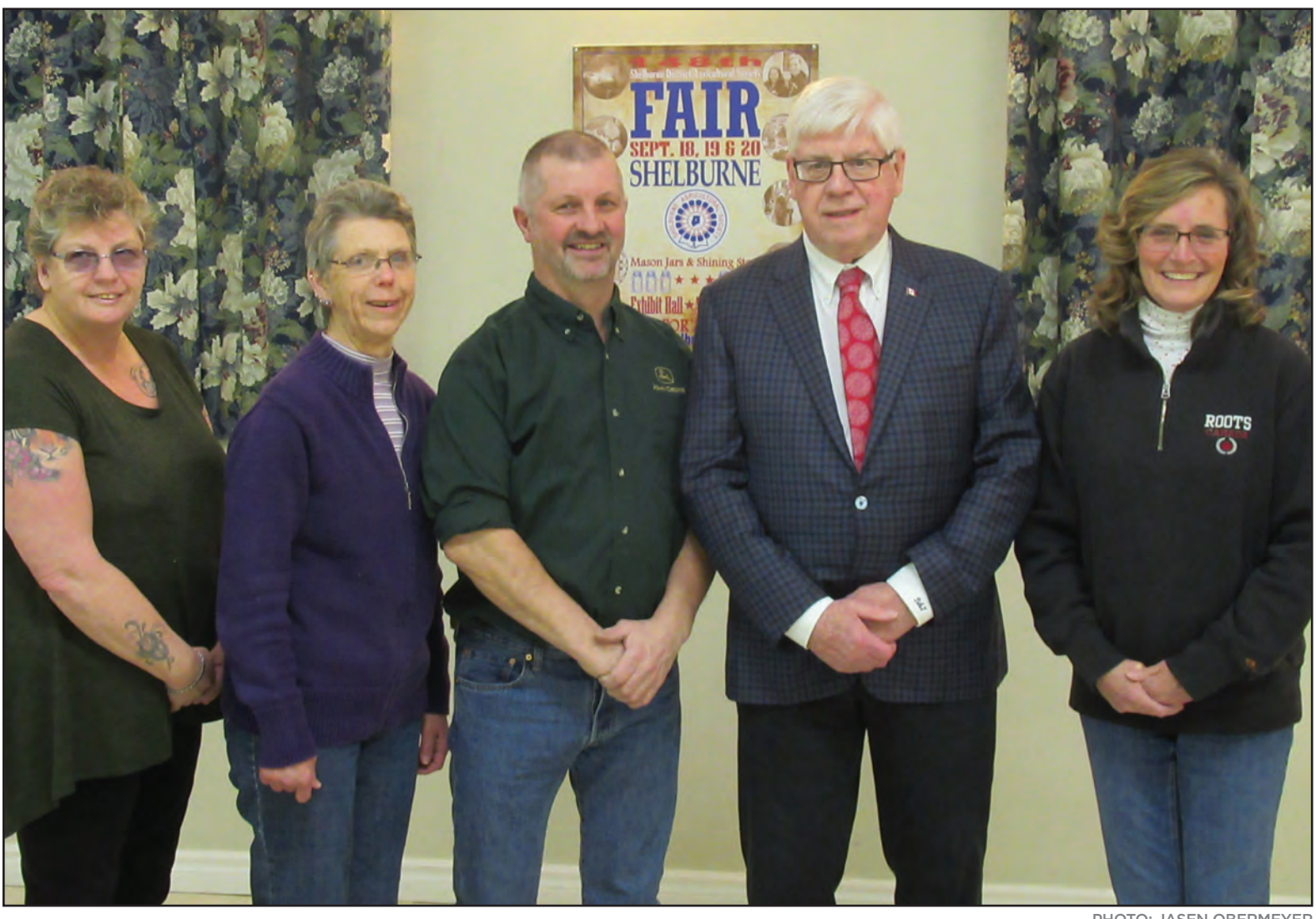
RAKING IN THE MONEY: Dufferin-Caledon MP David Tilson (second from right) presented a cheque of $11,000 to the Shelburne Agricultural Society on Tuesday (Mar. 7). The money will be used towards the town's annual Fall Fair, specifically to put material down on the ground from the Agricultural centre to the assembly hall, making it easier for people with disabilities to move around. The society still needs to raise around $6,000, and is looking for a partnership to help cover the remaining costs for the fair.