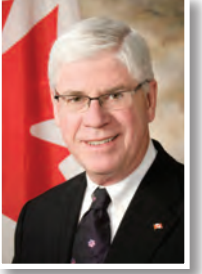
DAVID TILSON M.P.

Fraud Prevention Month helps to refresh our memory on the many types of fraud and what we can do to protect ourselves against this horrible crime. In doing so, we can significantly reduce our risk of becoming a victim.