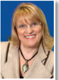
SYLVIA JONES, MPP M.P.P.

In the end, no legislative reset will get back the billions of dollars the Liberals have wasted including, $8 billion on eHealth according to the Auditor General, $1.1 billion cancelling the gas plants, $400 million on PRESTO card cost overruns, and $4.5 million salary for the CEO of Hydro One.