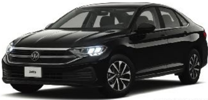
2 TO CHOOSE FROM