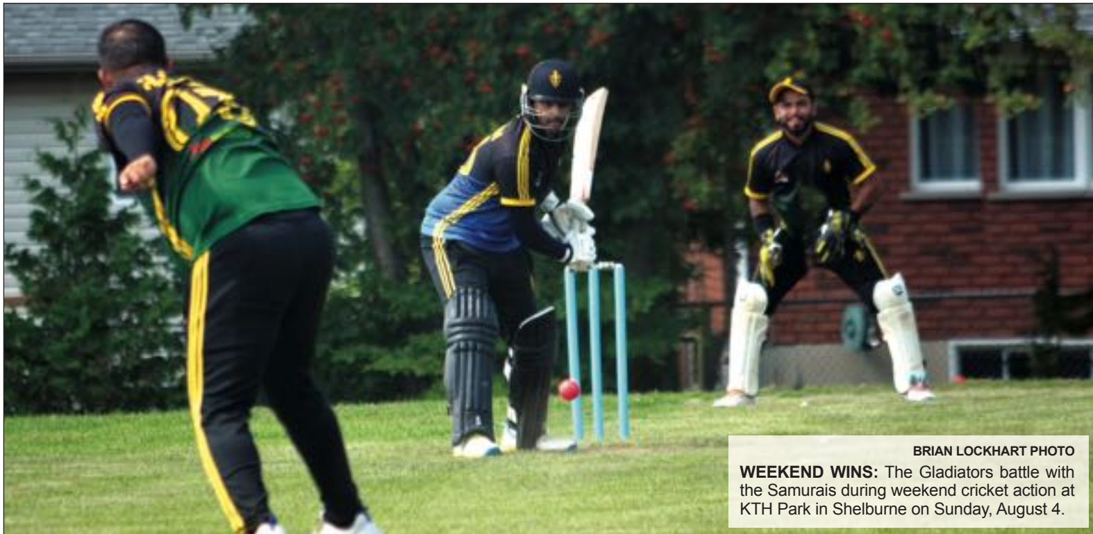
WEEKEND WINS: The Gladiators battle with the Samurais during weekend cricket action at KTH Park in Shelburne on Sunday, August 4.

Winning the toss, the Gladiators opted to