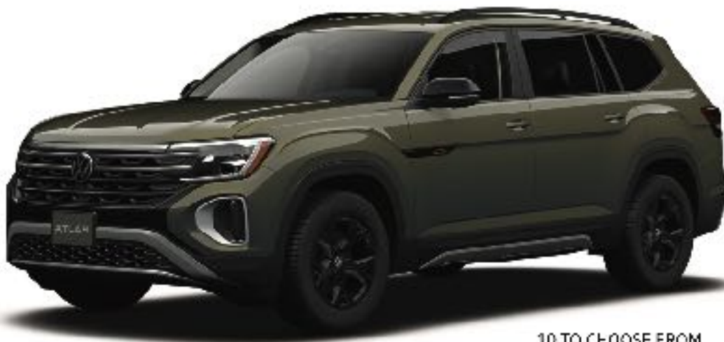
10 TO CHOOSE FROM