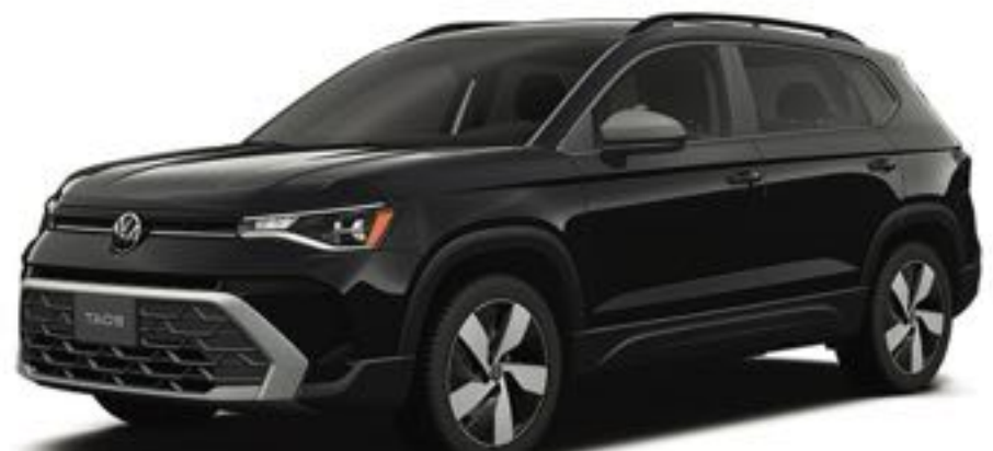
15 TO CHOOSE FROM