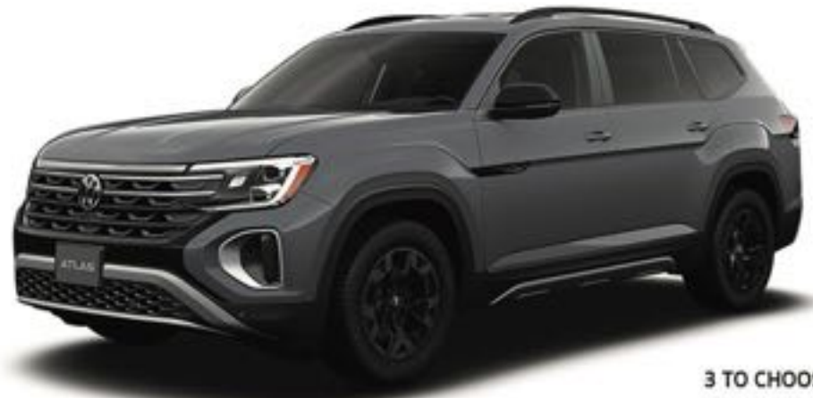
3 TO CHOOSE FROM