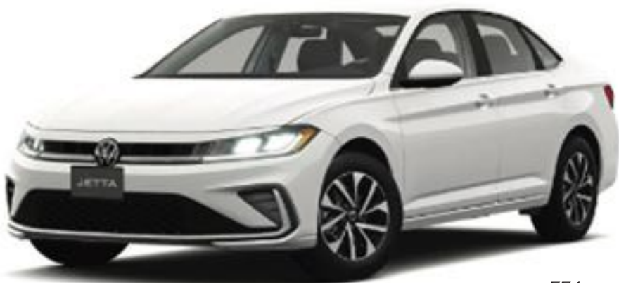
774 3 TO CHOOSE FROM